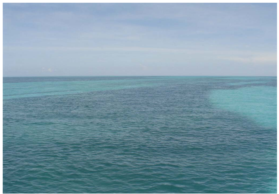
Syringodium and sand habitat west of the Marquesas Keys, Florida