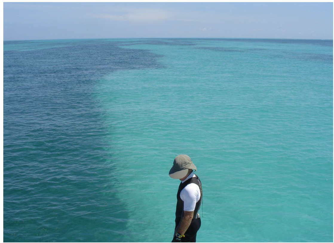
Six kilometers west of the Marquesas Keys where large green turtles were captured.