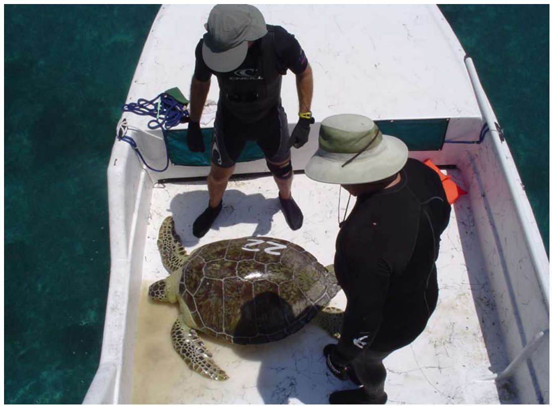
Large green turtle (Chelonia mydas) prior to release, west of the Marquesas Keys.