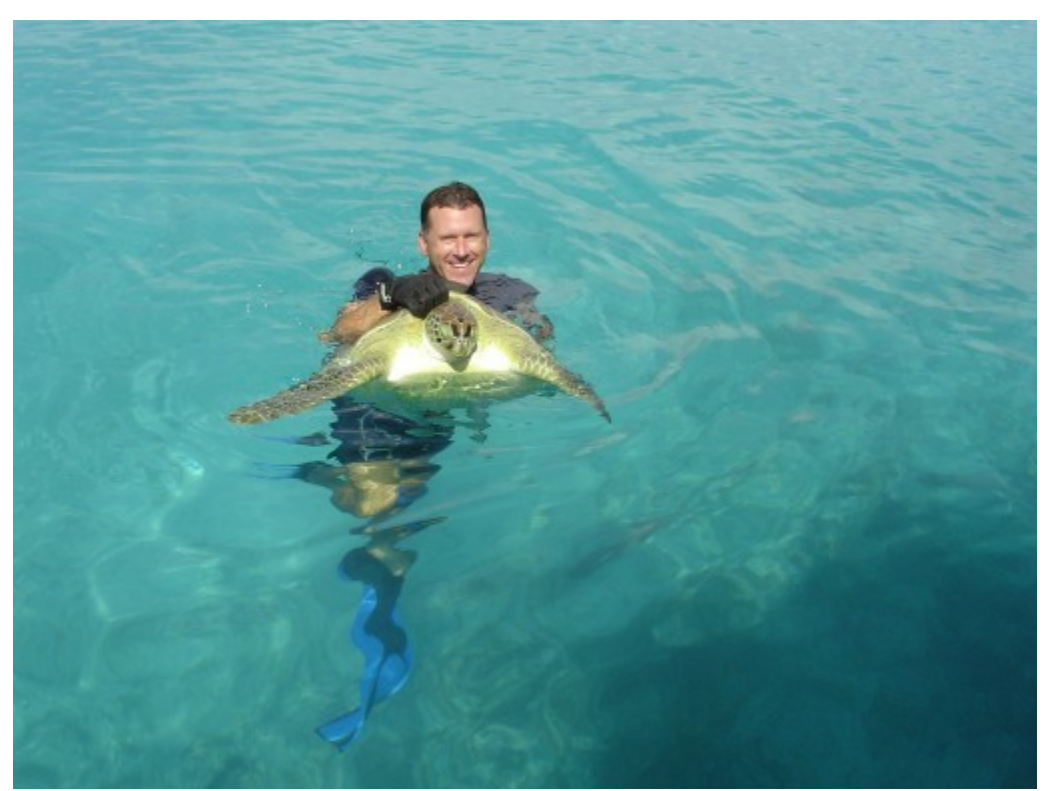
Hand capture of a green turtle ( Chelonia mydas ) west of the Marquesas Keys.