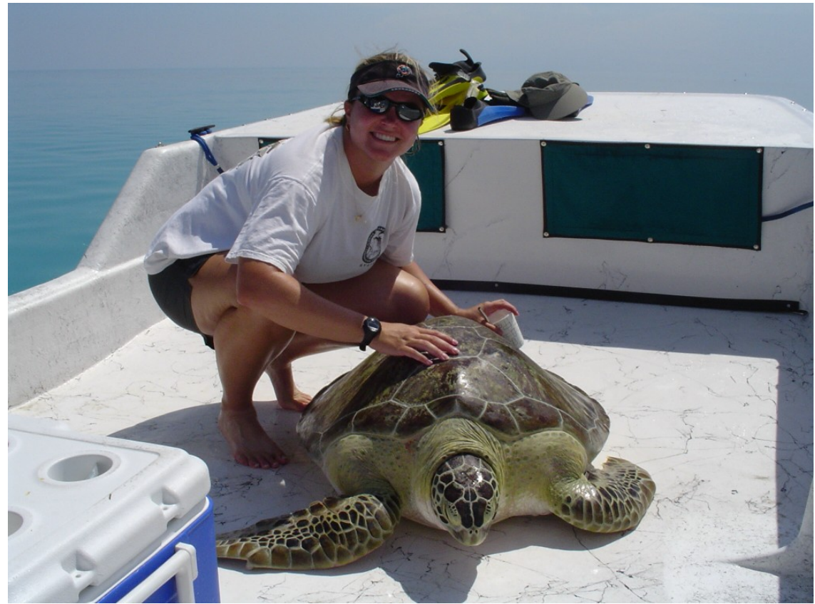
Large green turtle (Chelonia mydas) captured west of the Marquesas Keys.