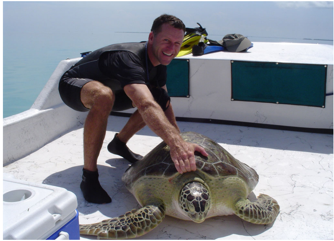
Green turtle (Chelonia mydas) captured west of the Marquesas Keys.